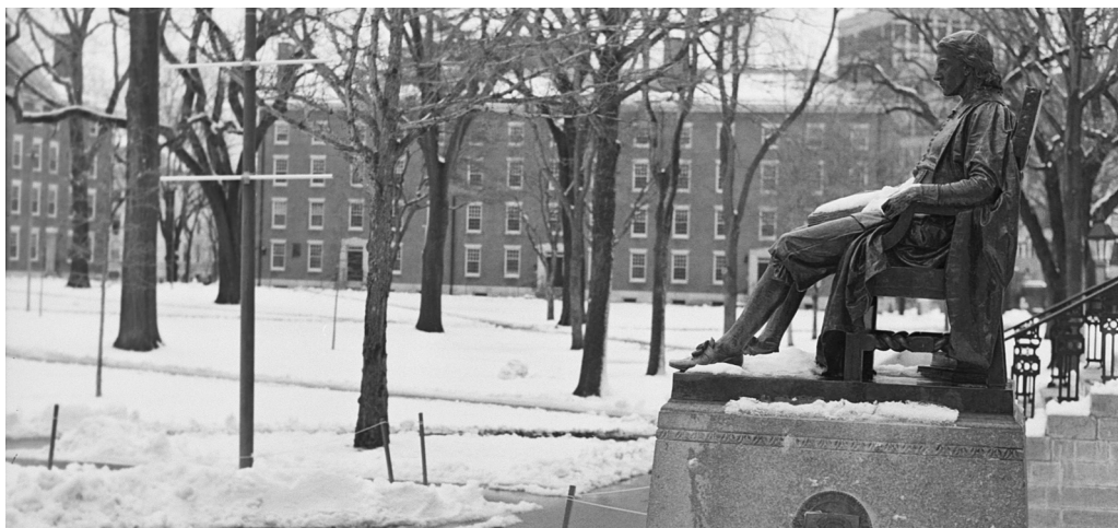
By Jeromel Dela Rosa Lara '23

9:00 am HILLBILLY AT HARVARD 12:45 pm PRELUDE TO THE MET (time approx.) 1:00 pm METROPOLITAN OPERA The Met's First Decade on the Air. Highlights from historic Met broadcasts. 4:00 pm POST-MET VOCAL PROGRAM (time approx.) 5:00 pm HARVARD BASKETBALL Women's, Harvard vs. Yale. 7:30 pm SATURDAY SERENADE